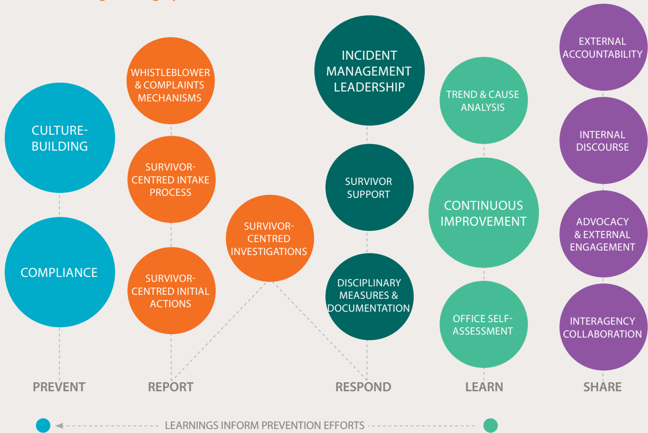
Figure 1: The Safeguarding System

Larger sized bubbles require more significant effort. The spectrum represented at the bottom shows how World Vision applies lessons learned: individual learning events and ongoing case management are used to inform prevention efforts.